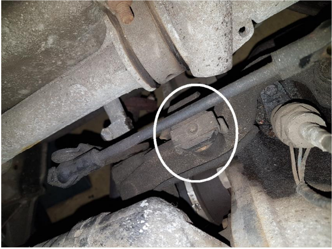
Remove central linkage pin.