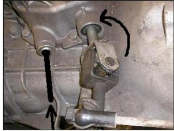
Stick drill of 5mm into the hole and turn to lock.