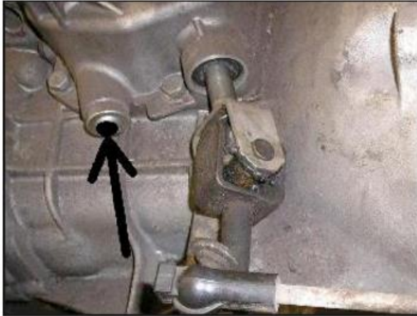
Remove black plastic plug from gearbox.