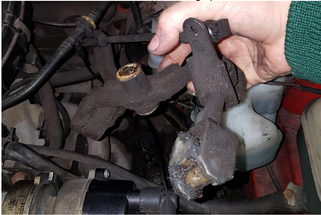
Remove standard shift mechanism